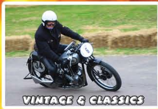
VINTAGE & CLASSICS