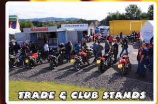
TRADE & CLUB STANDS